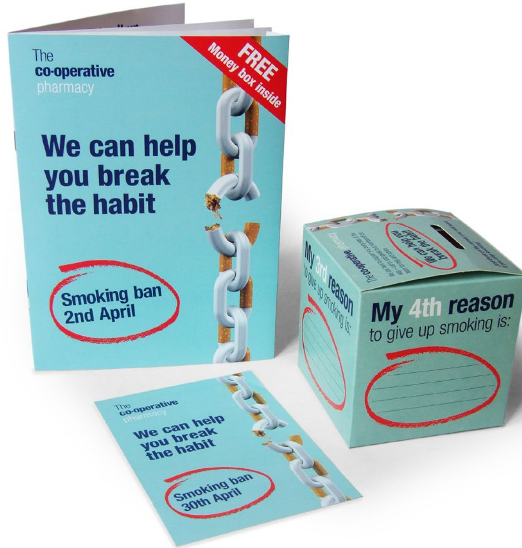
Pharmacy stop smoking campaign with 3D cigarette chains