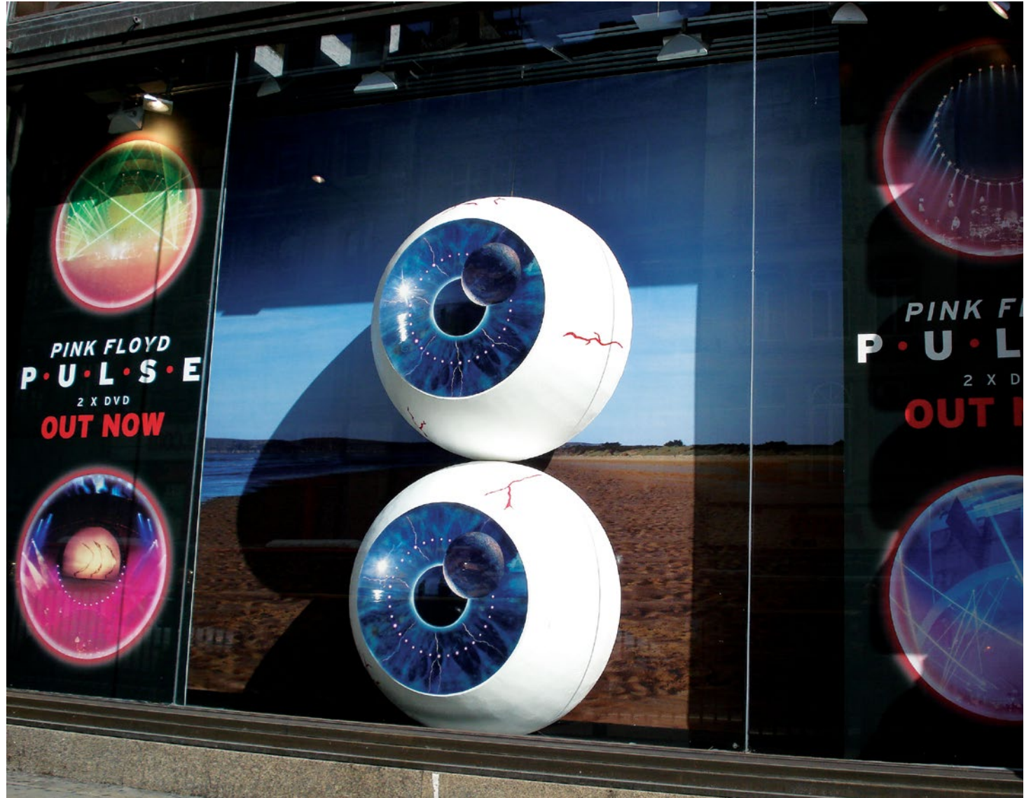
Multi level window display with 3D eyes

We designed and had dressed Virgin Megastore windows on Piccadilly, Oxford and Regent Street. With limited imagery and lots of photoshop work we produced anything from large format backdrops, vinyls, lighting to 3D models and banners.