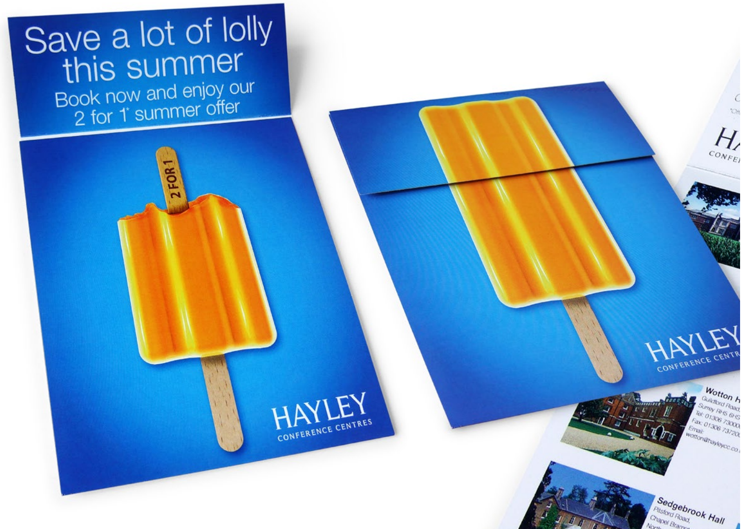
Lolly 2 for 1 offer mailer

3D and photoshop illustration was needed for this summertime lolly DM to promote a cool offer of 2 for 1 delegate rates at Hayley Conference Centre venues.