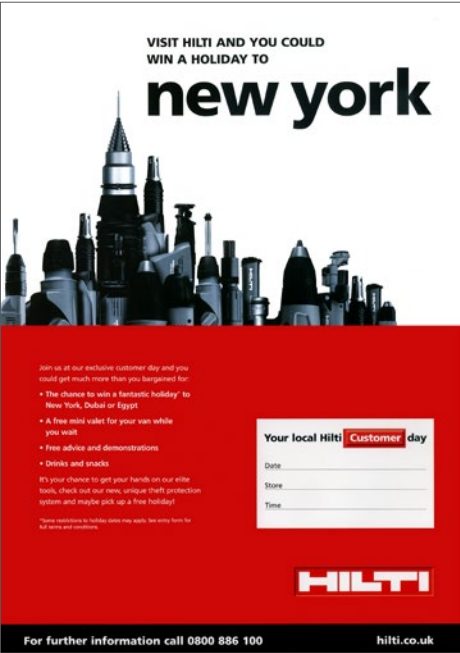
Three poster set

Choosing the main holiday prize to back up the promotion I composed the following famous landmarks from Hilti tools, consumables and parts.